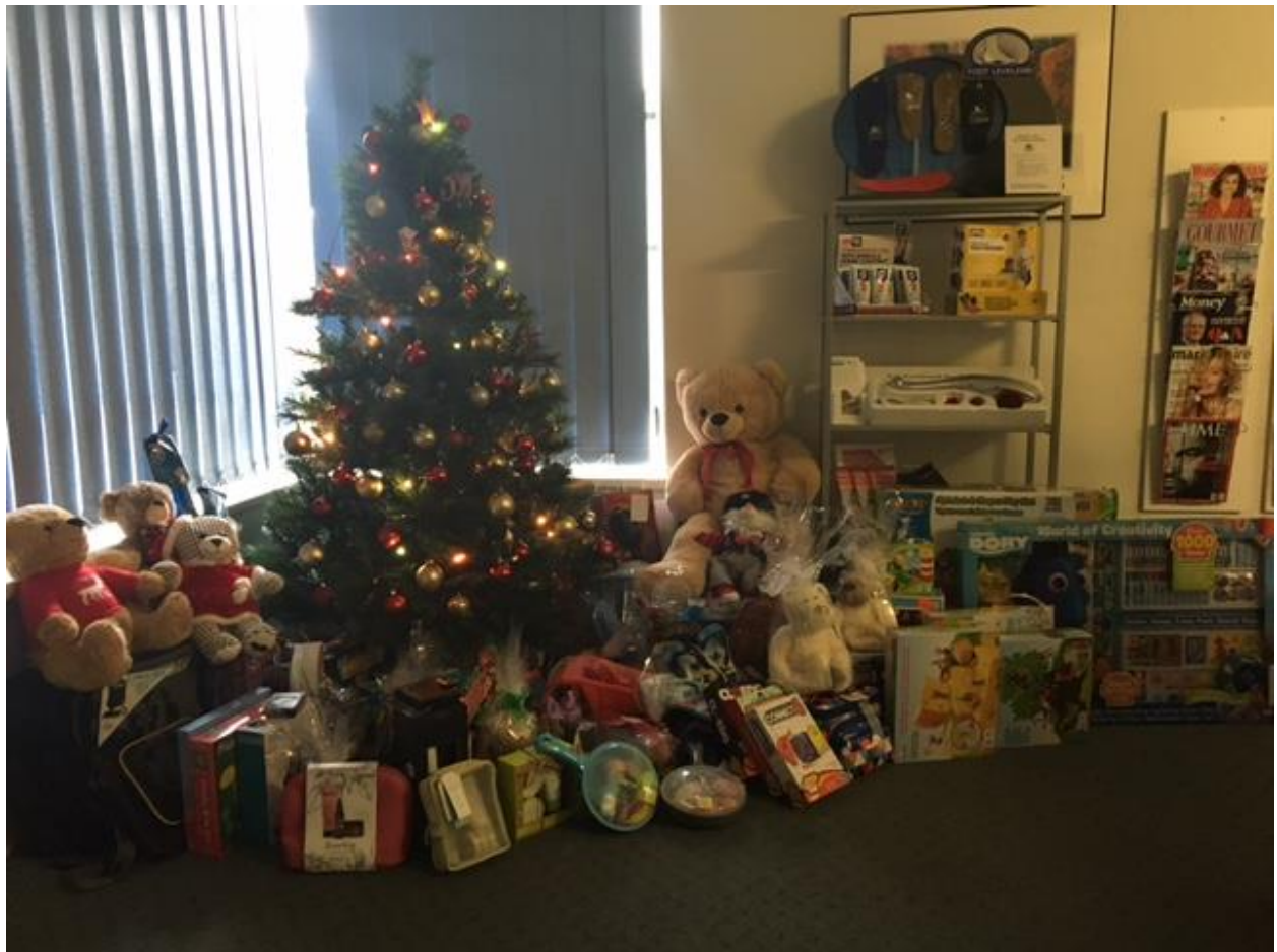
Figure 4: Elgar Road Chiropractic generously provided toys