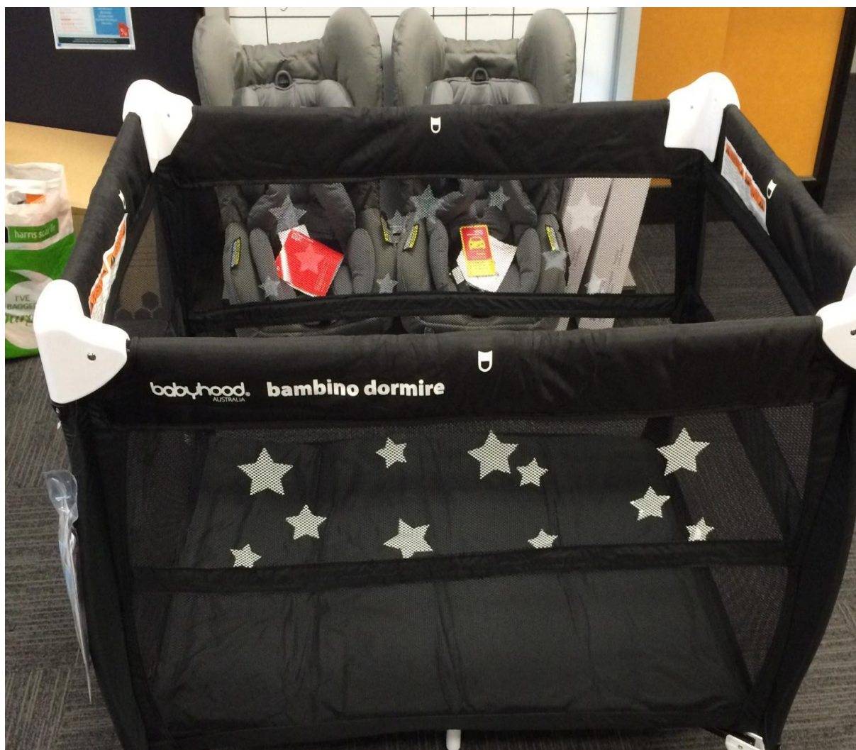
Figure 5: New children's equipment from Rotary Club of Box Hill