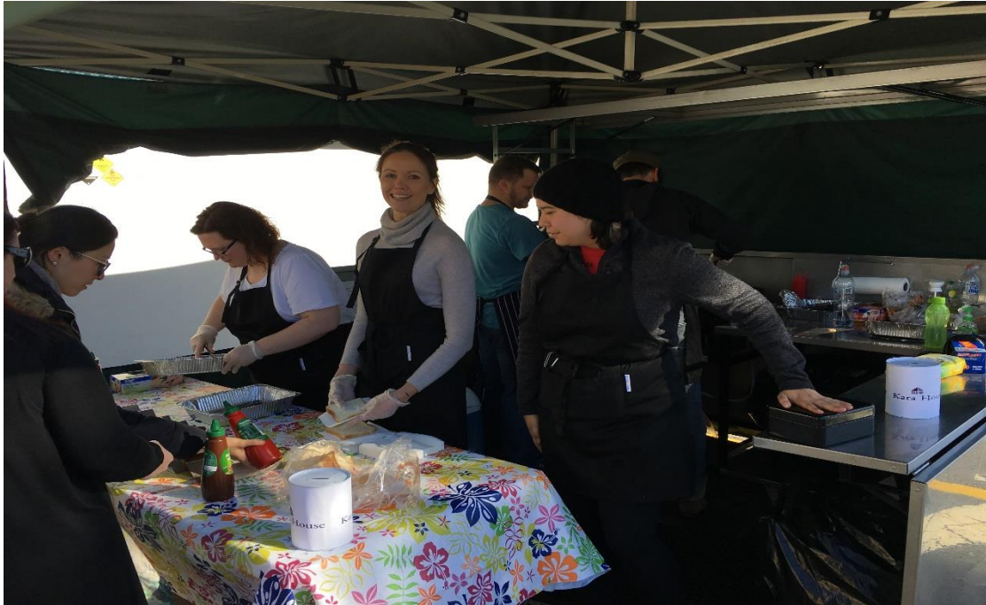
Figure 1: Kara House supporters and Management Committee members fundraising with a Bunnings Sausage Sizzle