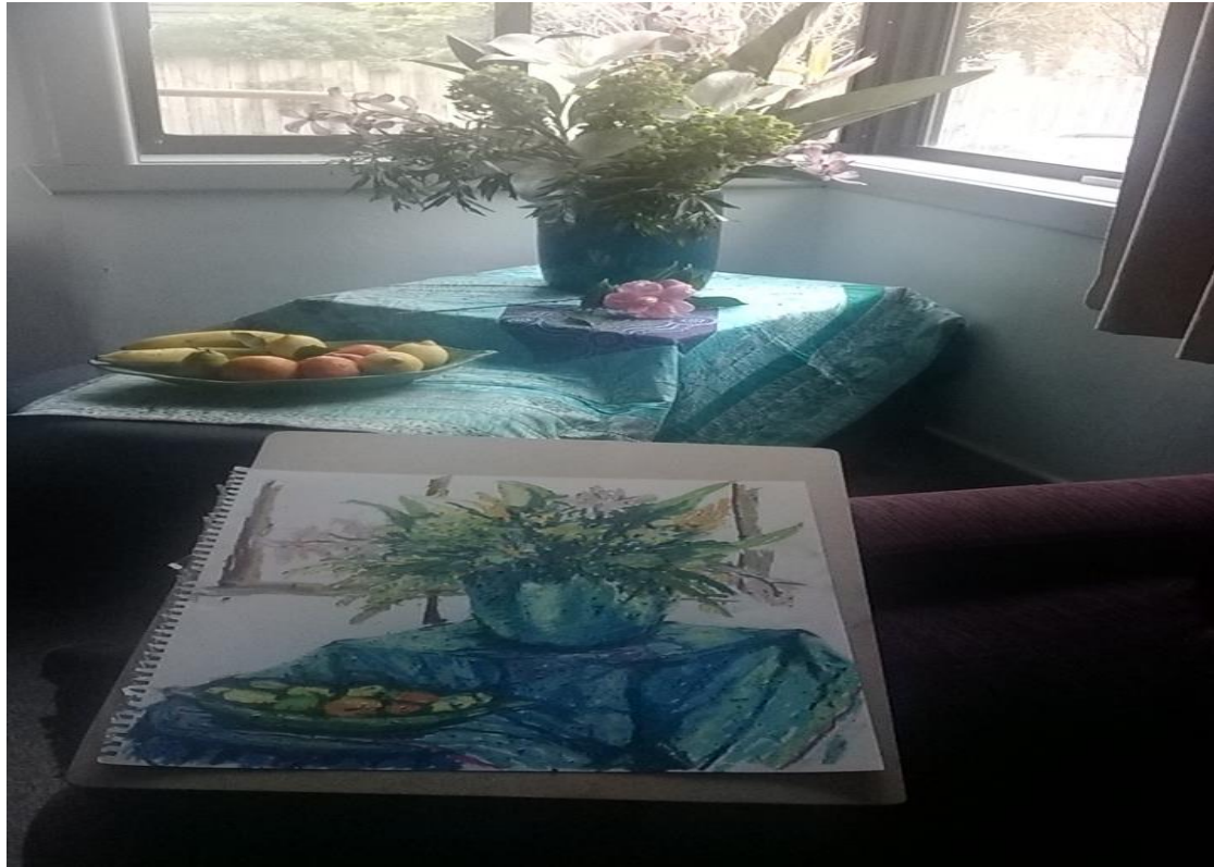
Figure 6: Client well-being activities- Still Art

By the time a woman comes into refuge she is exhausted. She is emotionally drained, she is tired, she has no energy and often feels physically unwell.