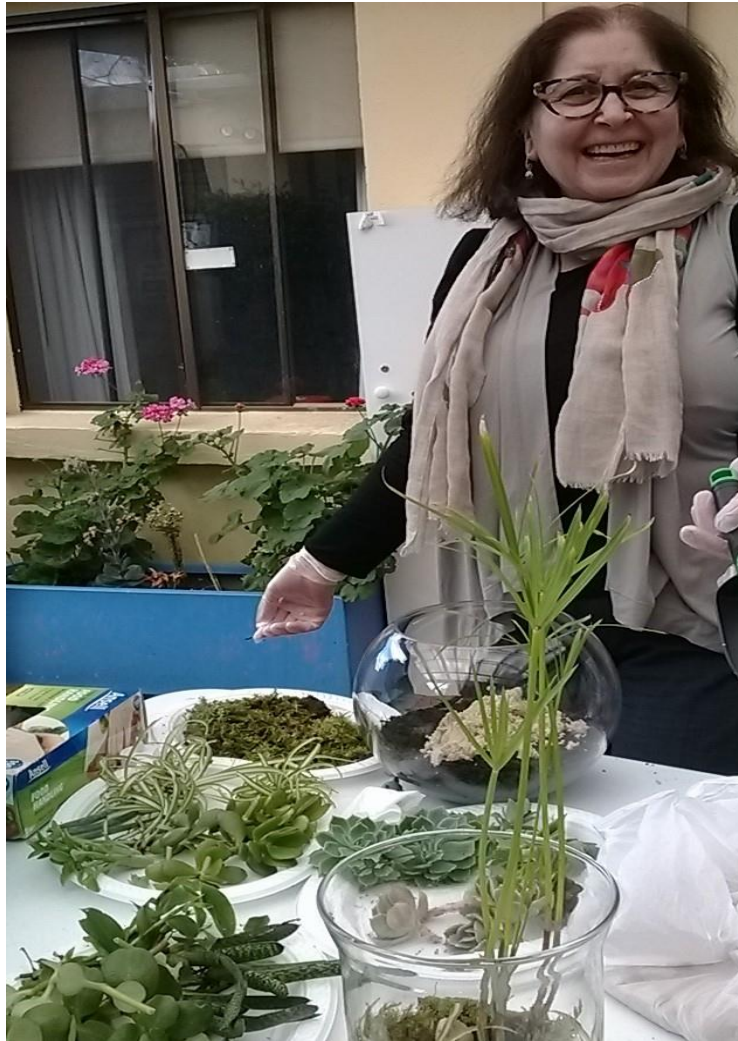
Figure 7: Kara House staff member- client well-being activity Terrariums