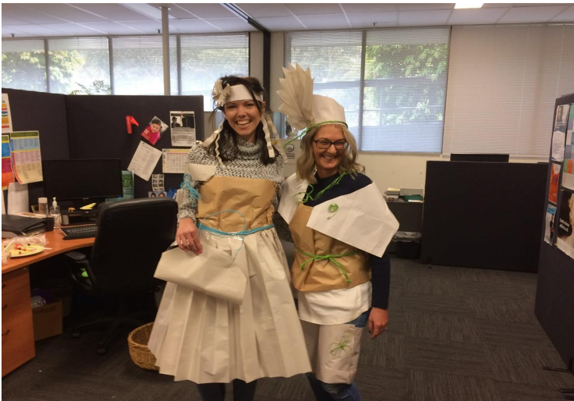
Figure 2: Teambuilding activity- Kara House Strategic Planning